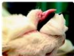
EVA Vet Plus Digital Sensor in position on a feline mandible.